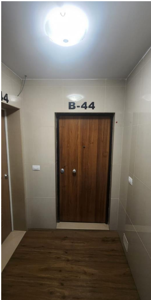
B44 → FLOOR 7