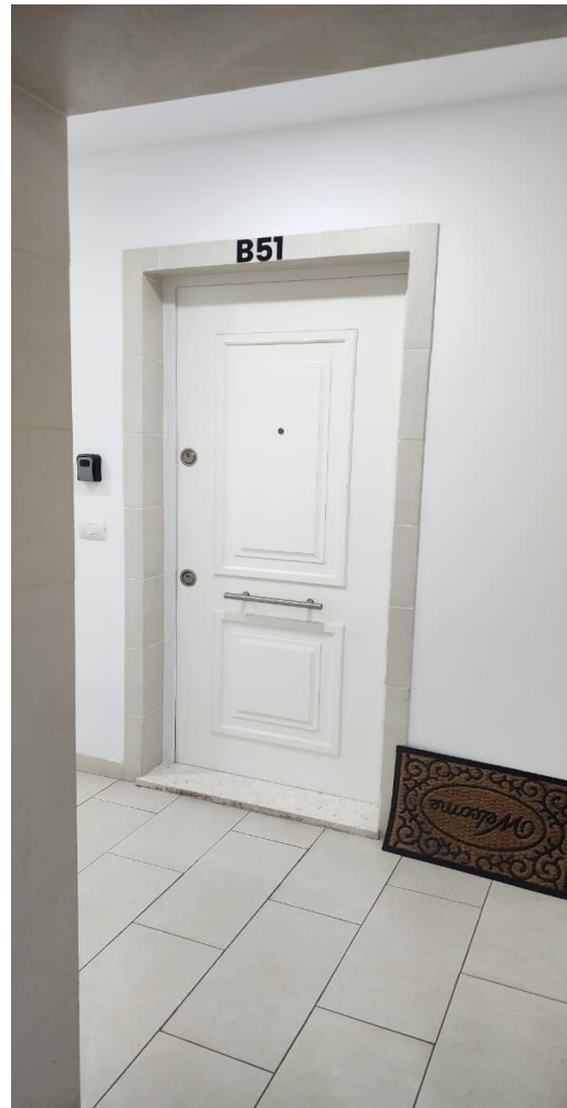
B51 & K2 → FLOOR 8